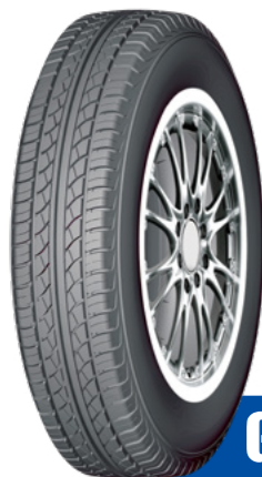
GREEN POWER S1