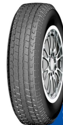
ST RADIAL TIRES