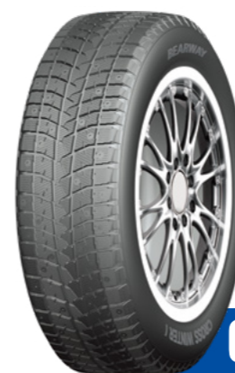
CROSS WINTER I